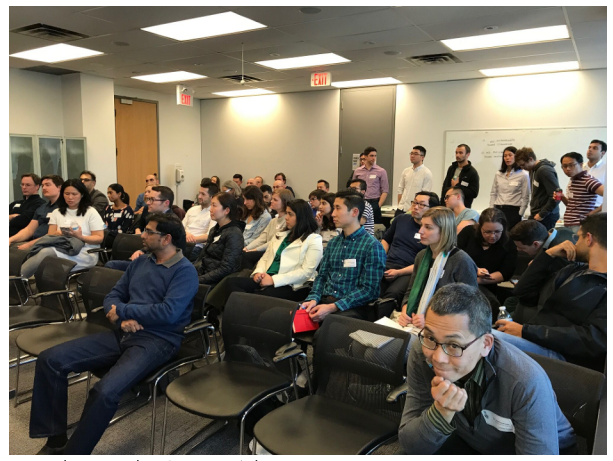
Attendees at the Career Night

The Department of Anesthesia hosted their annual Career Night for residents and fellows on April 15, 2019 at 123 Edward Street.