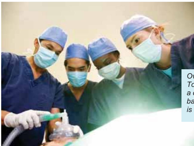
Over the last six years, University of Toronto affiliated hospitals have developed a collaborative inter-professional team-based anesthesia practice, a model which is now being adopted across Canada.

University of Toronto anesthesiologists have also been active in co-developing, with the Faculty of Nursing (University of Toronto), the curriculum for the Nurse Practitioners/Anesthesia Program. This is the first such program in Canada and it plans to build on the close professional relationship already in place between anesthesia and nursing. The didactic and practicum components of the course are being lead by the University Health Network and Mount Sinai Hospital anesthesiologists. The course will expose graduates to the full scope of anesthesia practice with particular emphasis on the pre- and post-operative components of anesthesia care. The course will start in 2009 and its progress will be actively followed by many.